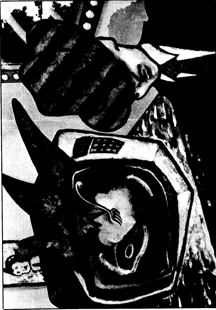
A Fork in Atomic Bob's Microwave 24" x 36" Acrylic on Masonite