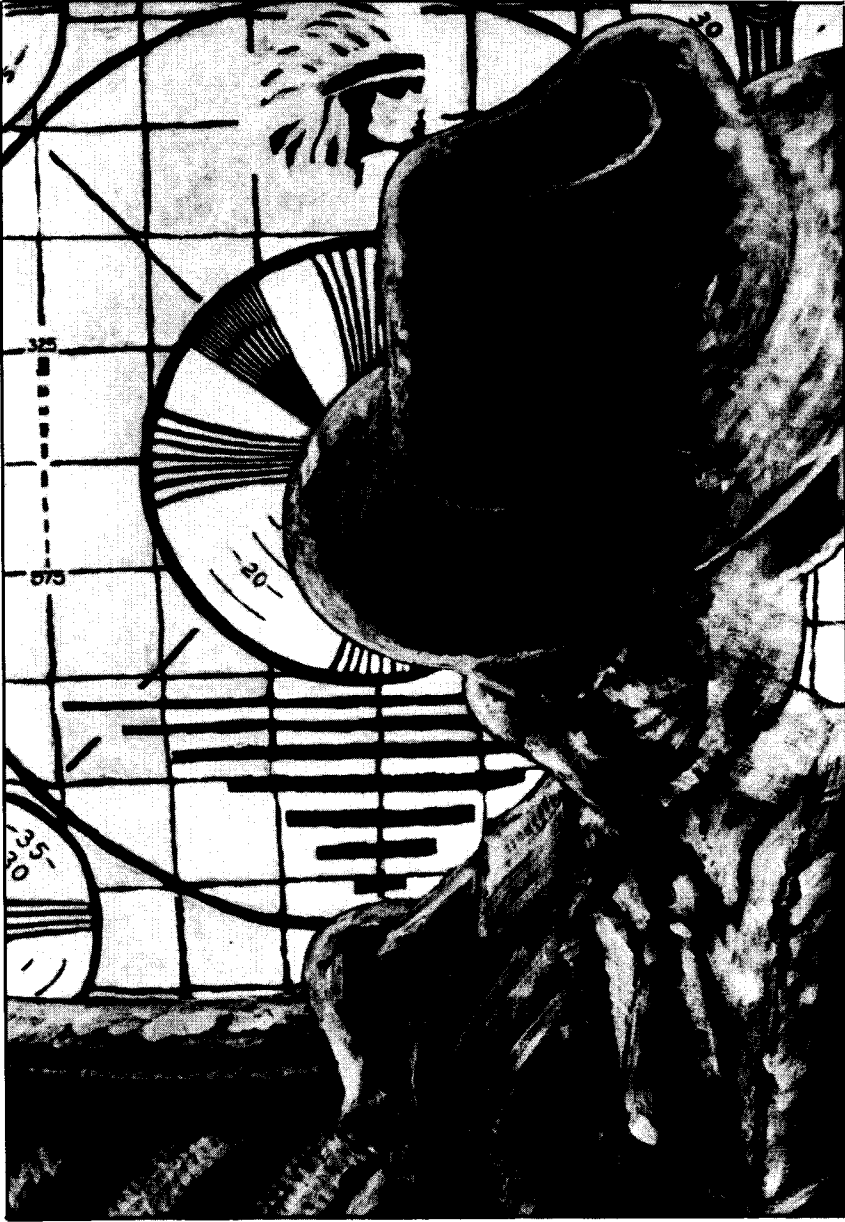
Atomic Bob and the Modern Mandala